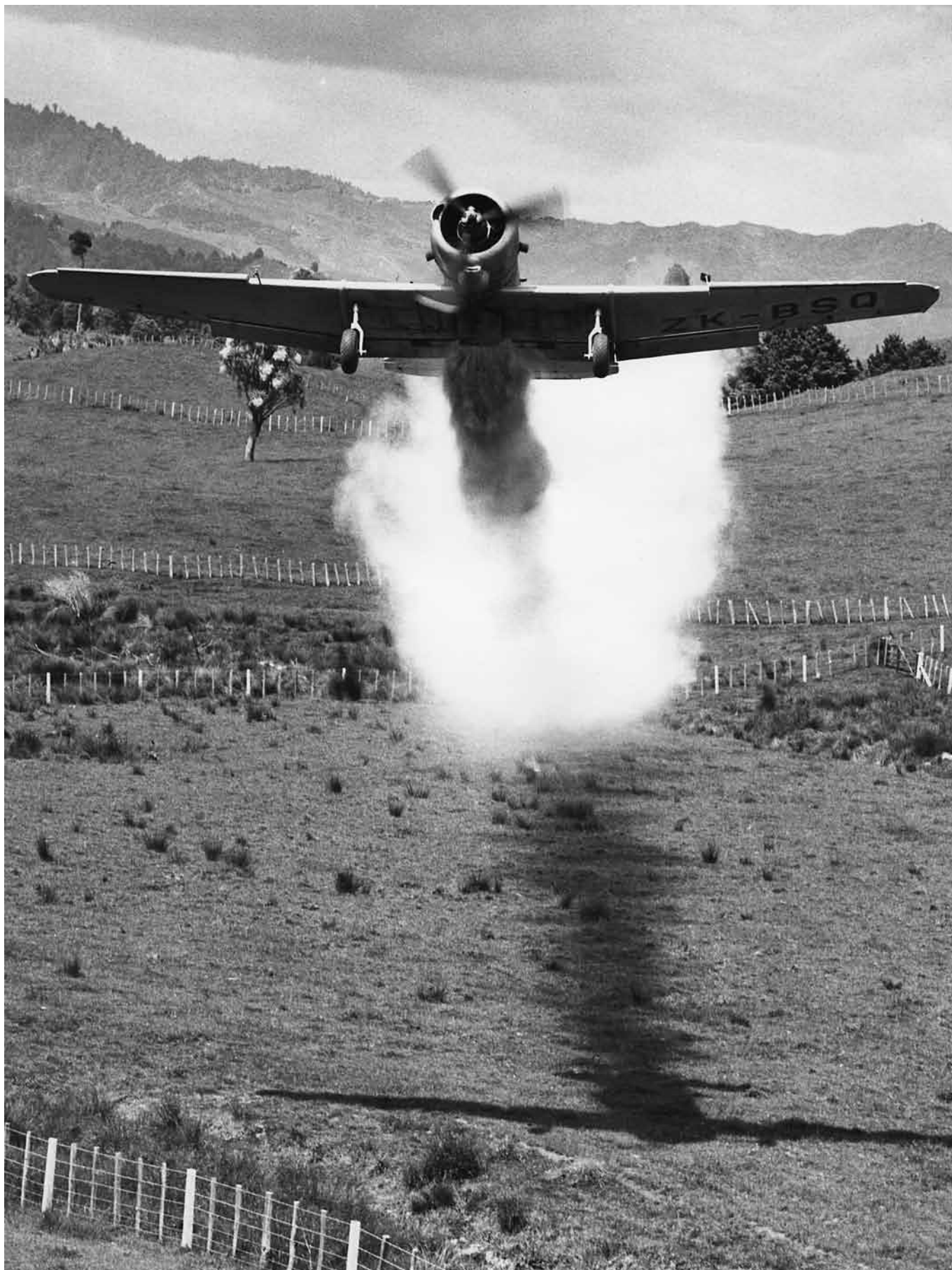
ACTION: "A spectacular shot of the Wanganui Aero Work Ceres near Taumarunui" is how this Colin Seccombe photo is described in a recent publication featuring the history of aerial topdressing in New Zealand. Simply titled The Topdressers by Janic Geelen, this well illustrated book has an excellent chapter covering the central King Country. Included are a number of other local photos, many of which are in full colour. Information from Colin Seccombe's file, regarding the Ceres, notes it was taken for publicity purposes on Richie Soar's farm at Piriaka on 4 December 1963. Ceres ZK-BSQ, piloted by Richmond Harding, was based at Piriaka between July 1963 and May 1968.

- photo by Colin Seccombe, Taumarunui (ref: 13162).