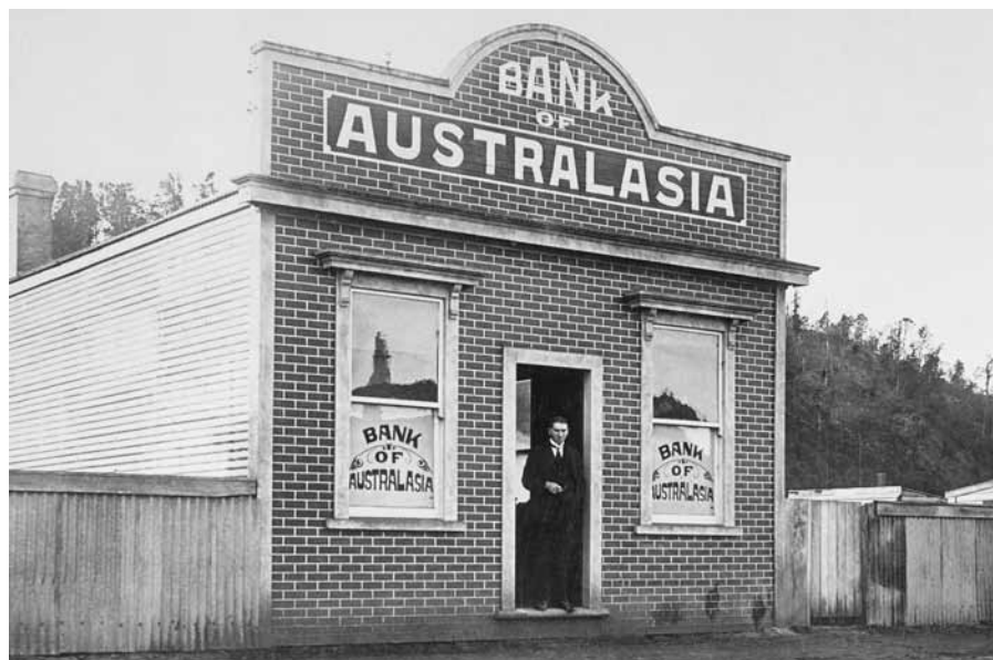
The false brick fronted building opposite the Post Office that was used by the Bank of New South Wales as their first premises (1922 to 1925). It was occupied earlier by the Bank of Australasia between 1912 and 1919.

It was described as being "in a good situation handy to both retail business on one side, and to Solicitors, Land Agents etc on the other side. Office accommodation for staff of four, building is sound, concrete