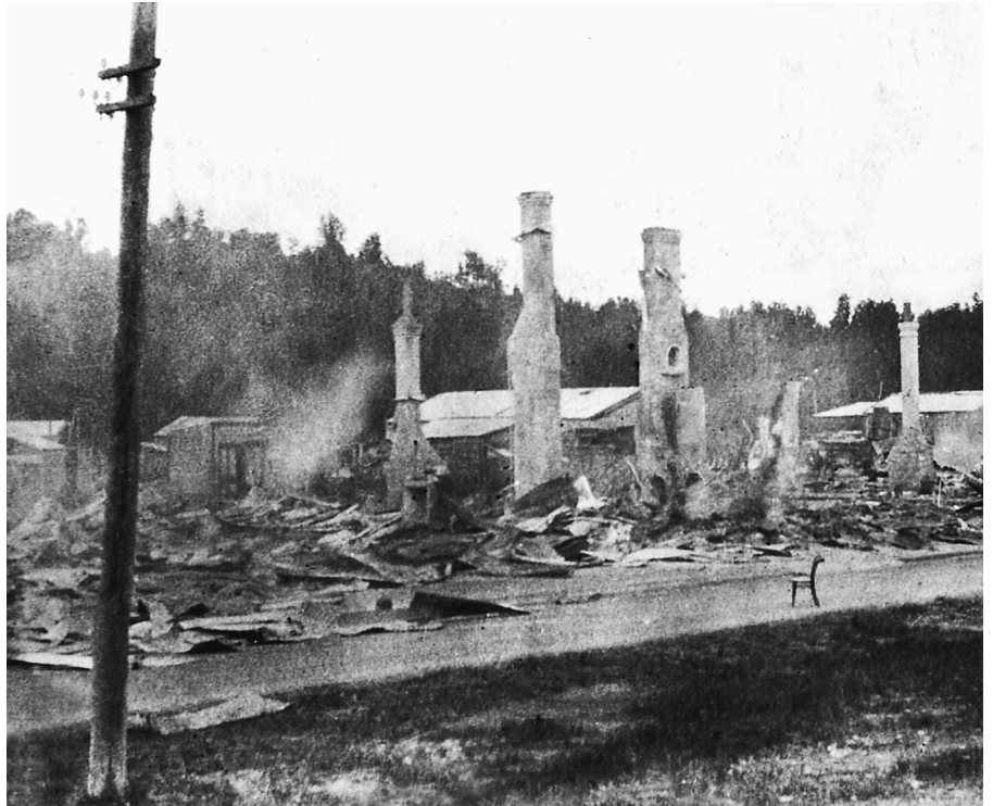
Prominent in this photo, taken the following day, are the three chimneys of the Railway Hotel along with masses of twisted corrugated iron and brick chimneys of the other businesses. All the chimneys were immediately ordered to be demolished for safety sake but the Spiral Hotel chimney apparently fell whilst the fire was raging out of control.

FOOTNOTE: A full account with dramatic fire photos appears on pages 8 to 10.