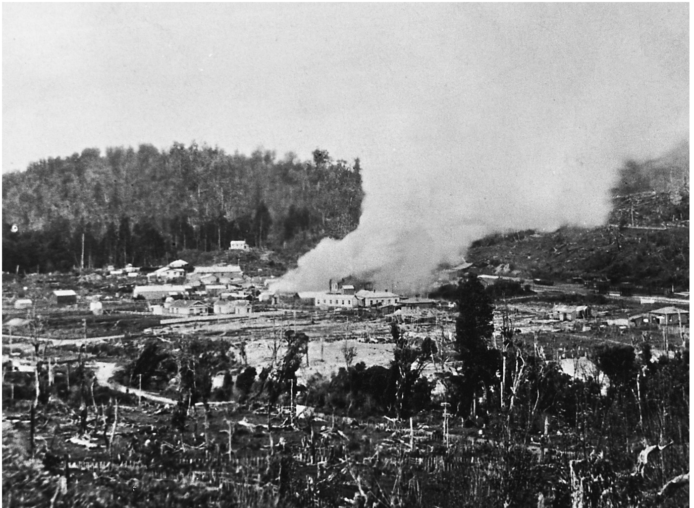
A dramatic moment in history is caught in this snapshot. The fire already has a good hold when the unknown photographer stops to record his first view of the disaster which wiped out the main street of Raurimu. The Spiral is in the right background.

photo courtesy Brosnan collection (ref: 13976).