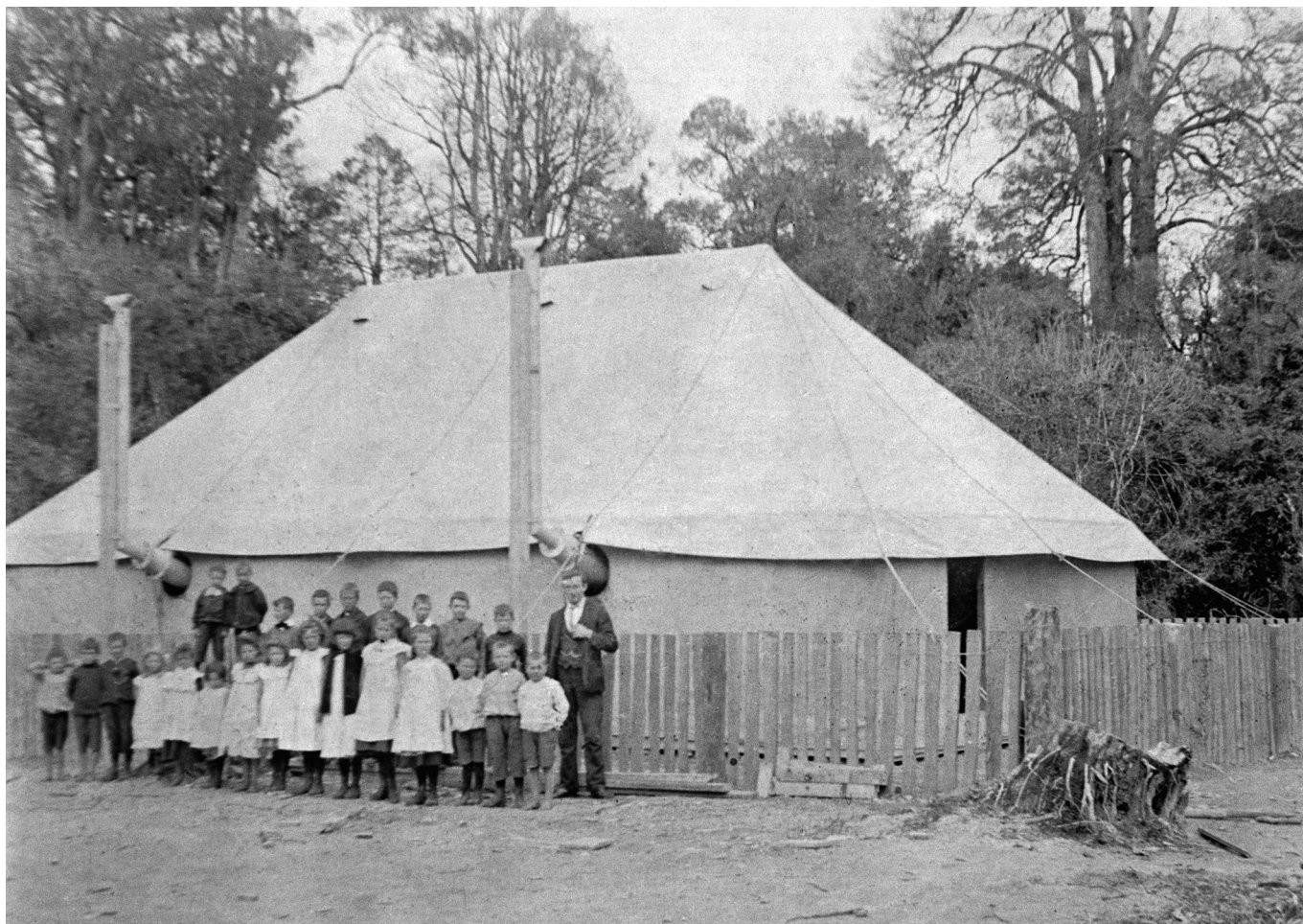
The headmaster, Mr Con Rogers, poses with 24 pupils outside their "Canvas School" at Whakapapa in the 1904 to 1905 period. The chimneys indicate a degree of comfort although it would be interesting to speculate on the standard of the interior. This wooden floored marquee seems rather large for 24 pupils but could have doubled as living quarters for the headmaster.