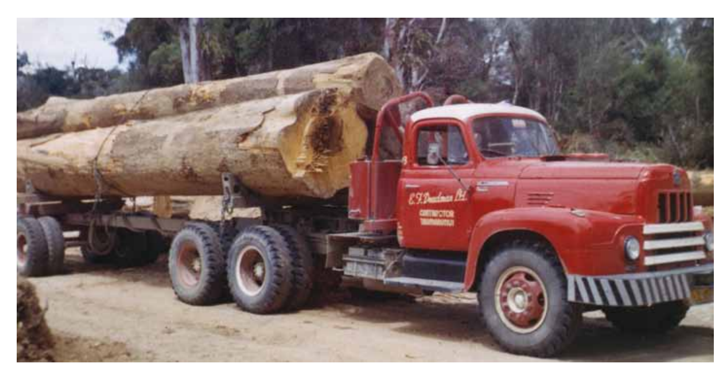
Eric Deadman's R195 International had its bonnet extended by RossTodd Motors to fit a new 6-71 GM diesel motor with the body modifications being of such high standard that it is almost impossible to detect any changes. Eric was so happy that he had two more trucks fitted out by RossTodd.