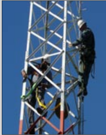
The radio transmitter mast being demolished 8 April 2010